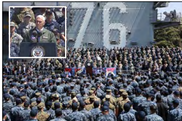
VP Mike Pence speaking from the deck of the aircraft carrier Ronald Reagan in Japan

Christians continue to be executed globally. On the world's Palm Sunday, two more Christian churches were blown up killing and injuring many. Nations