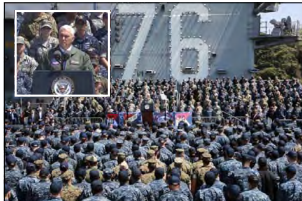
VP Mike Pence speaking from the deck of the aircraft carrier Ronald Reagan in Japan

North Korea responded with "In the case of our super-mighty preemptive strike being launched, it will completely and immediately wipe out not only U.S. imperialists' invasion forces in South Korea and its surrounding areas but the U.S. mainland and reduce them to ashes" it said according to Reuters.