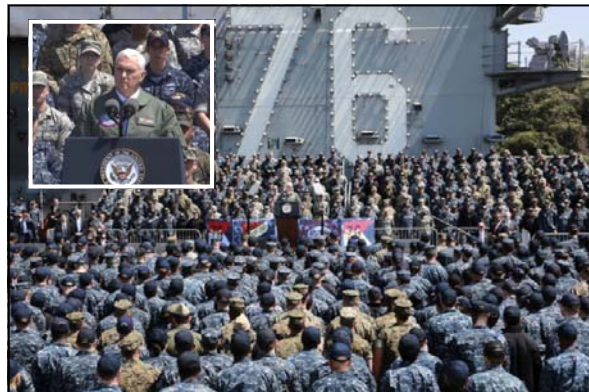
VP Mike Pence speaking from the deck of the aircraft carrier Ronald Reagan in Japan

Christians continue to be executed globally. On the world's Palm Sunday, two more Christian churches were blown up killing and injuring many. Nations